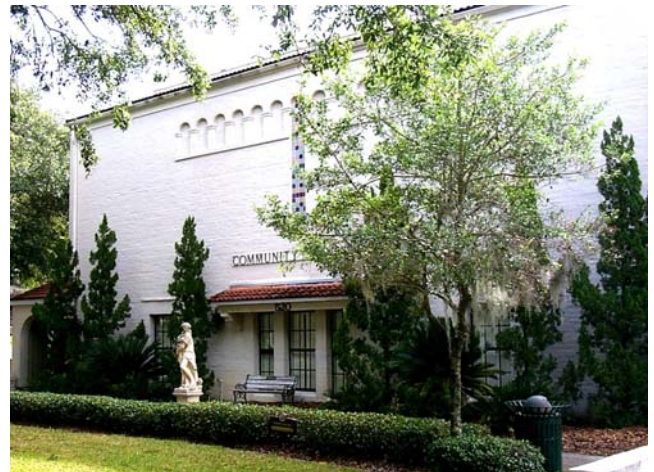
The Mount Dora Community Building will undergo a renovation beginning in late 2008.

Once the expansion and renovation is complete, the building will become a more usable, well-equipped space where future events will be held in a more comfortable setting for patrons. Construction is anticipated to begin in late 2008 or early 2009.